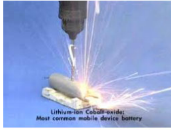
Lithium-ion Cobalt-oxide; Most common mobile device battery