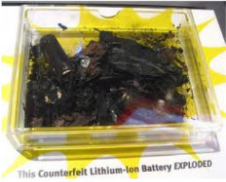
This Counterfeit Lithium-ion Battery EXPLODED